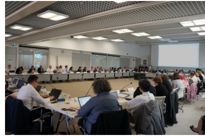
PIC/S Committee meeting in Geneva