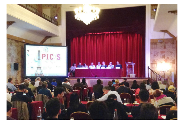
PIC/S Seminar 2014, at Cercle National des Armées Paris, France

The Seminar's objectives were to discuss about design, implementation and management of dedicated facilities as well as inspection strategies. The harmonisation of approaches on this topic is a critical point for both inspectors and industry.