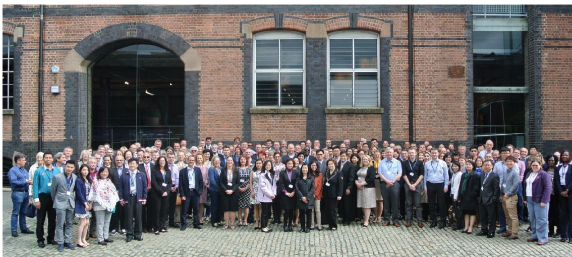
2016 Seminar - Official photo with participants

88. The last day of the Seminar was mainly devoted to the outcome of the workshops and the presentation of the next seminar, which will be hosted by Chinese Taipei / TFDA in Taipei on 13-15 September 2017. The topic of the seminar is the inspection of “Quality Control Laboratories”.