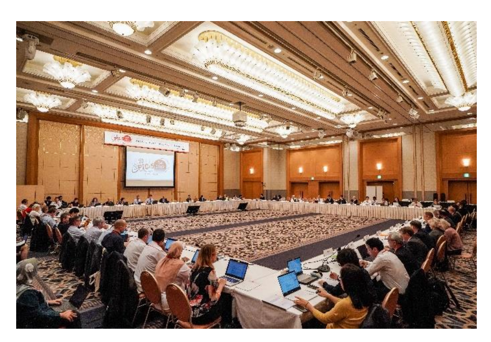
PIC/S Committee meeting in Toyama