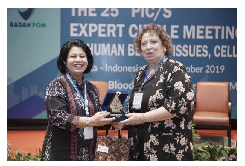
Expert Circle on Blood, Tissue, Cells & ATMPs in Jakarta