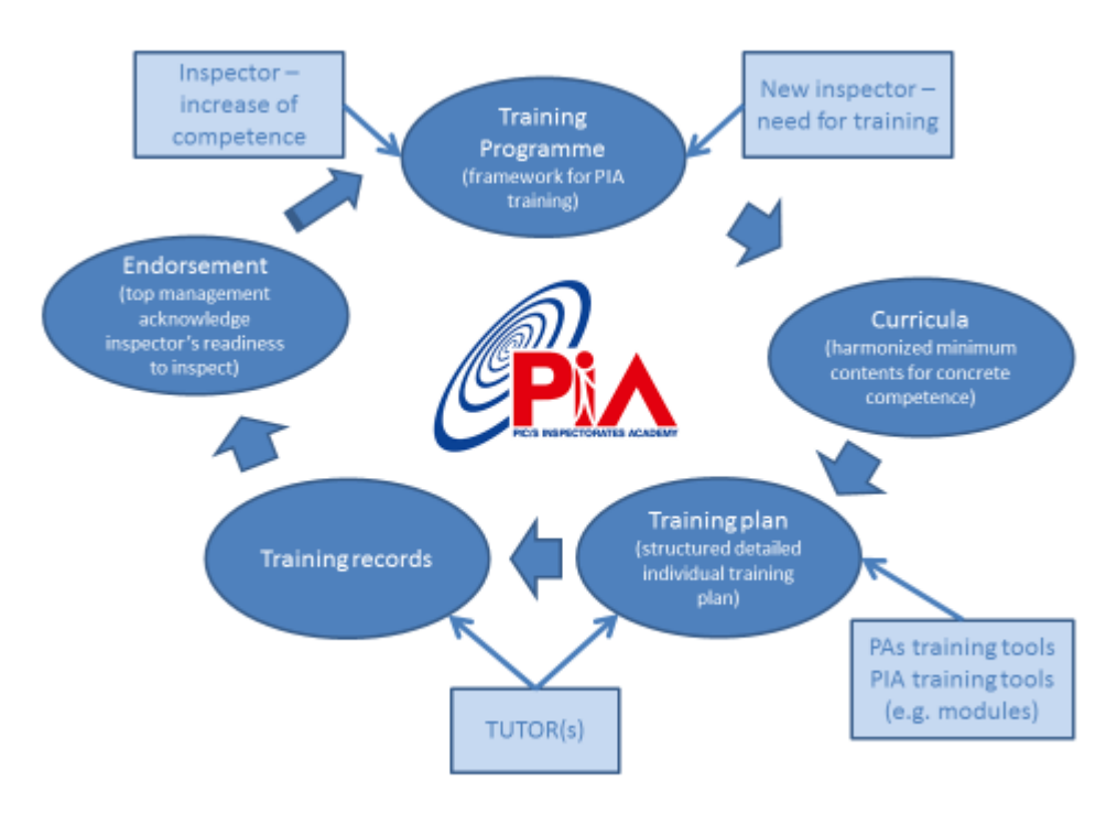
Draft Outline of PIA Training Cycle