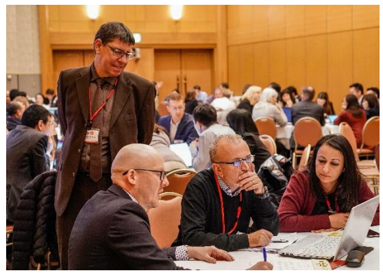
PIC/S 2019 Seminar audience, Toyama (Japan)

125. The Seminar, through a mix of presentations and workshops, provided participants with a better understanding of Annex 1, based on issues discussed during its current revision and through case studies of sterility assurance. The revision of Annex 1 is led by a PIC/S-EMA Working Group with WHO participation.